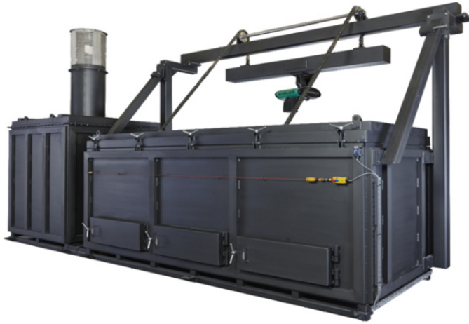
Fig. 1. Organic incinerator model