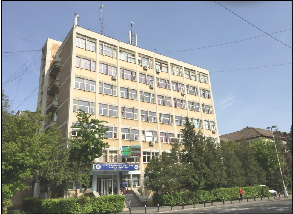
Fig. 2. Headquarters of „Vasile Goldiș” University Arad, Baia Mare Branch, 5 Culturii Street.

The library is located here as well, alongside two reading rooms, while the fifth floor has three multimedia labs, with 60 computers. There is also a room for equipment storage. Building B has four levels and contains “Dorel Chereches” Amphitheater (120 seats), a center for scientific research, meeting room and the secretariat, while Building C hosts the “Aris” Grand Hall (160 seats), “Vasile Goldiș” lecture hall (60 seats), a teachers lounge, the archives and the garages, adding to a total surface area of 3,800 square meters.