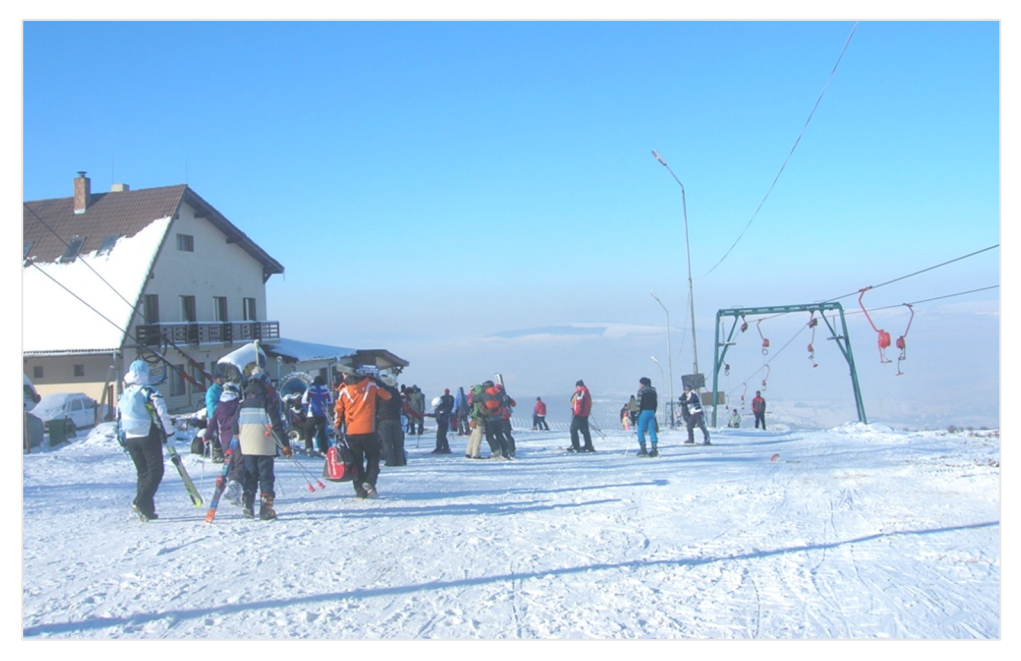
Fig. 2. Teleschi Guesthouse and the starting point of Feleacu ski slope

as well as a flat (for four people), which suggests an accommodation capacity of more than 50 beds. Imperial Guesthouse is probably the one which appears in the INS data with 16 accommodation beds, although its website states that there are 9 double rooms, so 18 beds. Gold Fayen House has, also according to its website, 21 beds in 8 rooms. "Lacul Micești" Guesthouse near Micești (in Tureni commune, too) provides 11 rooms to tourists, which accounts for about 22 beds, and a chalet for groups of 8 to 10 people. It comes out that the real accommodation capacity in Tureni commune is about 120 beds, compared to just 16 that are registered by the INS.