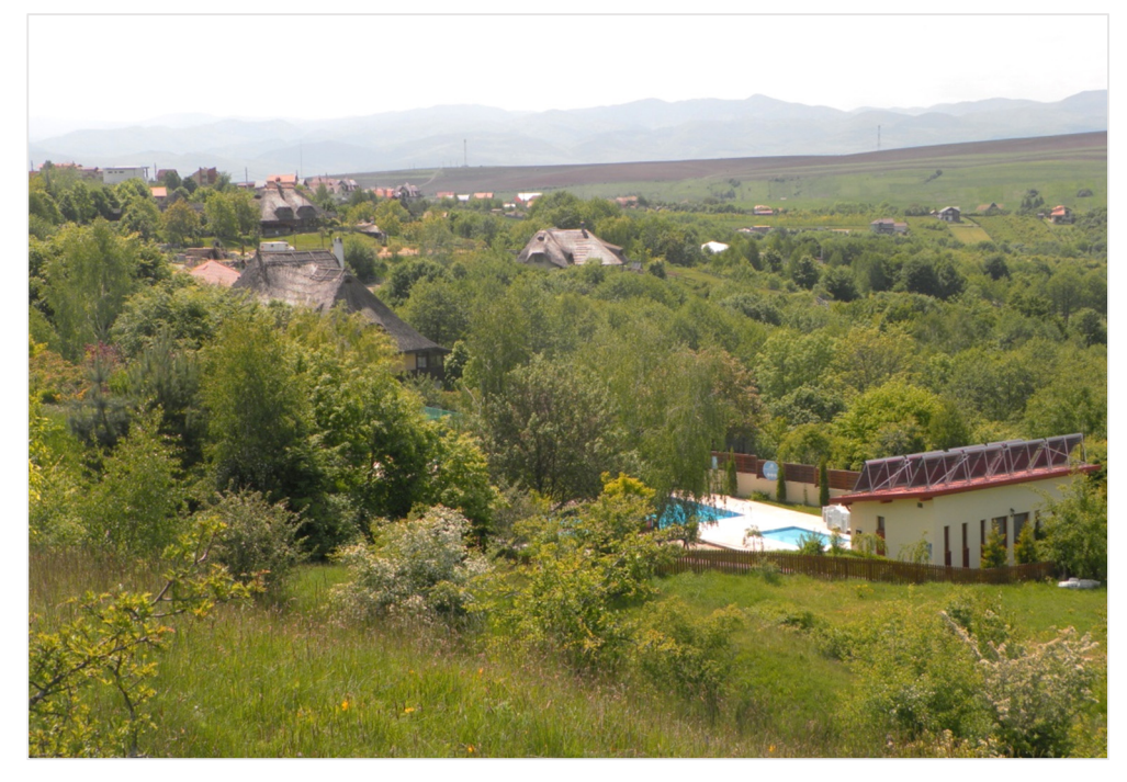
Fig. 3. "La Mesteceni" Guesthouse in the newly-built part of Sălicea village

After 2012, one noticed the same constant growth, based primarily on the ever higher number of overnights at the two guesthouses in Ciurila commune. In 2015, the values rise more than four times due to the overnights registered at Hotel Premier (Feleacu commune), more than 10000, representing almost 78% of all the overnights in the studied region.