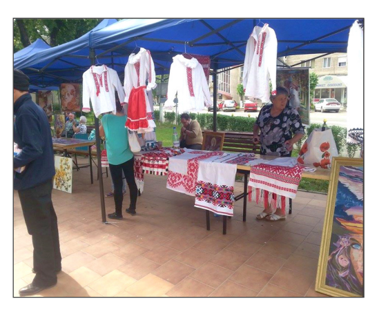
Fig. 3. The 2015 craftsman fair – Beiuş