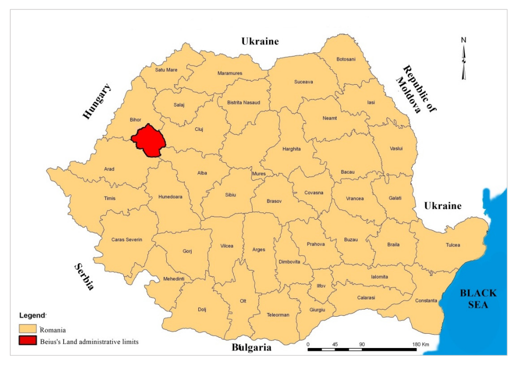
Fig. 1. The geographical location of the land of Beiuş in Romania

in the northern region Pădurea Craiului mountain group, Bihor and Vlădeasa to the east and the Codru Moma group to the south and south-east which highlights the beautiful interweaving of two major landforms: the Apuseni Mountains and the Criș Plain.