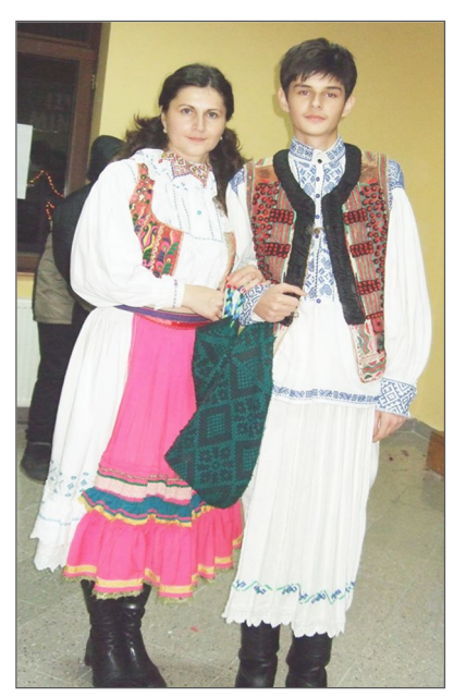
Fig. 2. Traditional costumes of Beiuş Region

THE SUSTAINABLE DEVELOPMENT OF TOURISM IN THE LAND OF BEIUŞ THROUGH RECREATIONAL ACTIVITIES