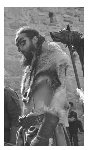
Fig. 2. The reenactment of the confrontation with Quinta Macaedonica Roman Legion during a Roman campaign ( Napoca Days , Cluj-Napoca, 2015 - when Cluj-Napoca City held the title of European Youth Capital ).