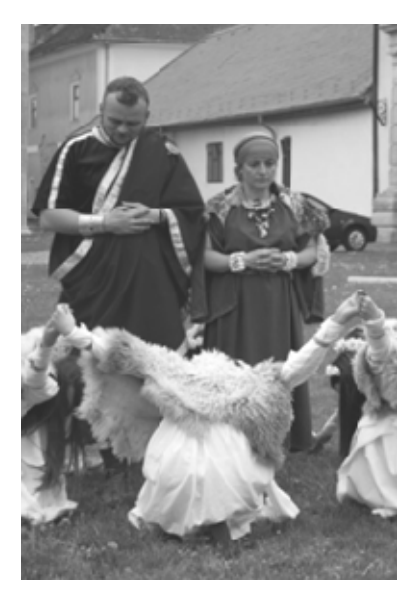
Fig. 3. The reenactment of an antique ritual to Mars during Alba Carolina Citadel Roman Festival (Alba Iulia).

Obviously, the audience manifests a positive attitude towards this manifestations, reenactment groups specialize themselves in narrow historical periods they reproduce, diversifying in interpretation, interactive activities, equipment and performances – representing factors of progress in this heritage interpretation form in Romania and proof of aspiration to the professionalism, the level and dedication of the reenactment association with a longer tradition mentioned before at the international level.