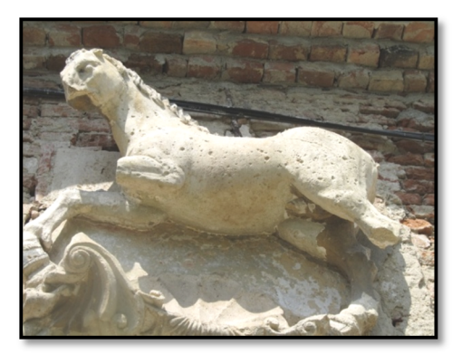
Fig. 3.Sculpture of Johannes Naghtigall, external ornament

With the second renovation of the old curia on the domain, in 1755, the "imposing stable<sup>20</sup>" was built (fig. 4), being now located in the perimeter of the Botanical Garden, ornamented with the coat of arms of the family, exposed on the Eastern side of the masonry while the Southern wall was ornamented with the sculpture of Johannes Naghtigall, which represents a small stallion (fig. 3.), the passion and faiblesse of the family from ancient times.