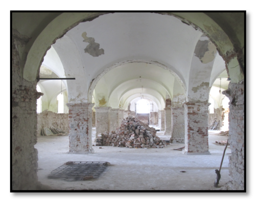
Fig.4. Inner image of D building

The inside room is spacious due to Romanic arches and the eight support pillars, sized for 28 horses.