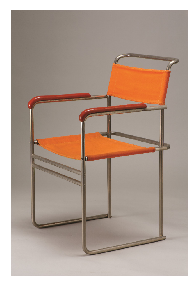
Fig 3. Breuer Marcell: tubular chair, 1930. Chrome-plated, bent steel tube, canvas, 86 x 52 x 45 cm. Museum of Applied Arts, Furniture Collection. 74.118.1