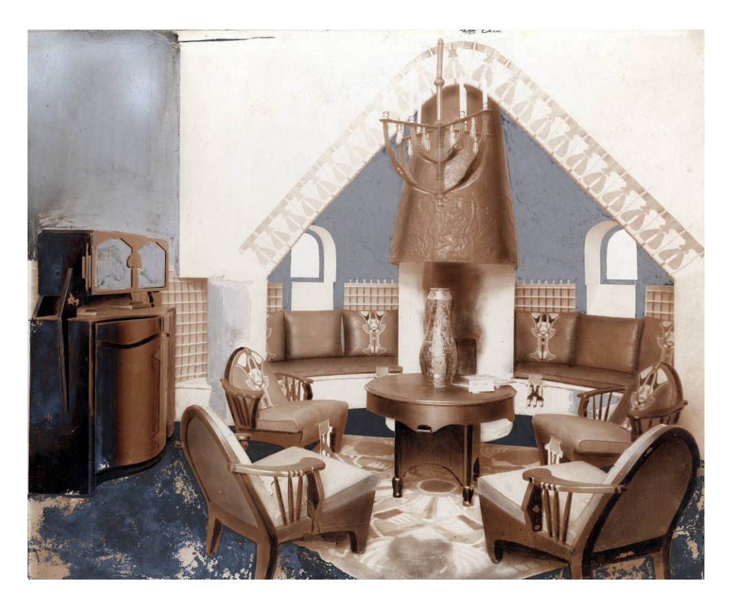
Fig 5. Exhibition photo - furnishing of a gentleman's smoking room at the Spring 1907 exhibition of the Society of Applied Arts. It was made by master carpenter József Mocsay according to the plans of Ede Wigand Toroczkai. Budapest, 1907. Black and white archive photo. Photo paper, 31 x 25 cm. Museum of Applied Arts, Archives, Photographic Collection, FLT 5308