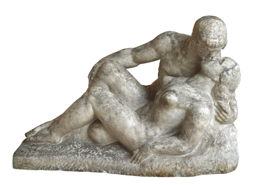
Fig 8. Corneliu Medrea: Kiss. c. 1942. ronde-bosse, plaster, 93 x 163 x 80 cm. signed by the artist C. MEDREA at the base in the lower register on the right-side Gift of the artist, 1948. Bucharest Municipality Museum, Medrea Collection. Inv. Nr. 155.