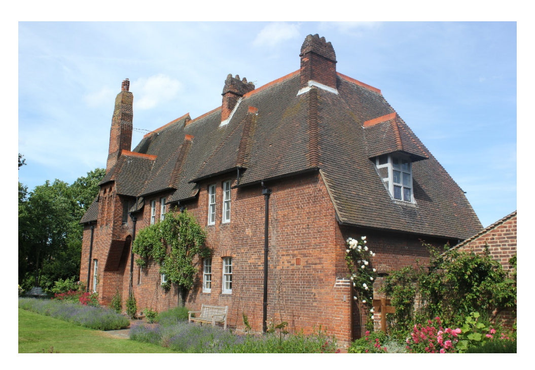
Fig 4. William Morris and Philipp Webb: Red House . Bexleyheath, 1859–1860.