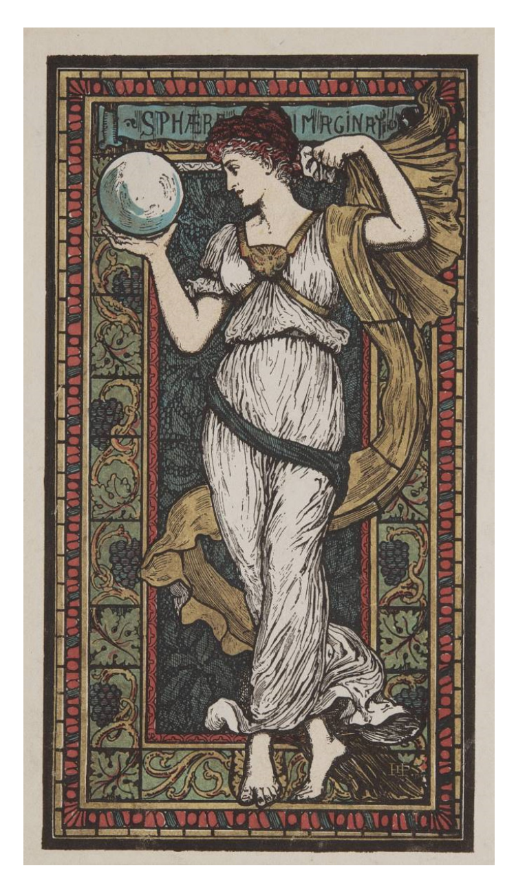
Fig 1. Walter Crane: Glass Window Design - Sphaera imaginationis . London, 1899, paper, colored, ink, 18 x 10.7 cm. Museum of Applied Arts, Archives. MLT 438