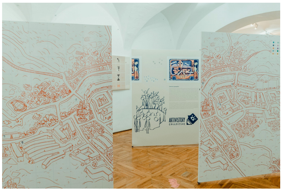
Fig. 7. Entrance to the exhibition space.