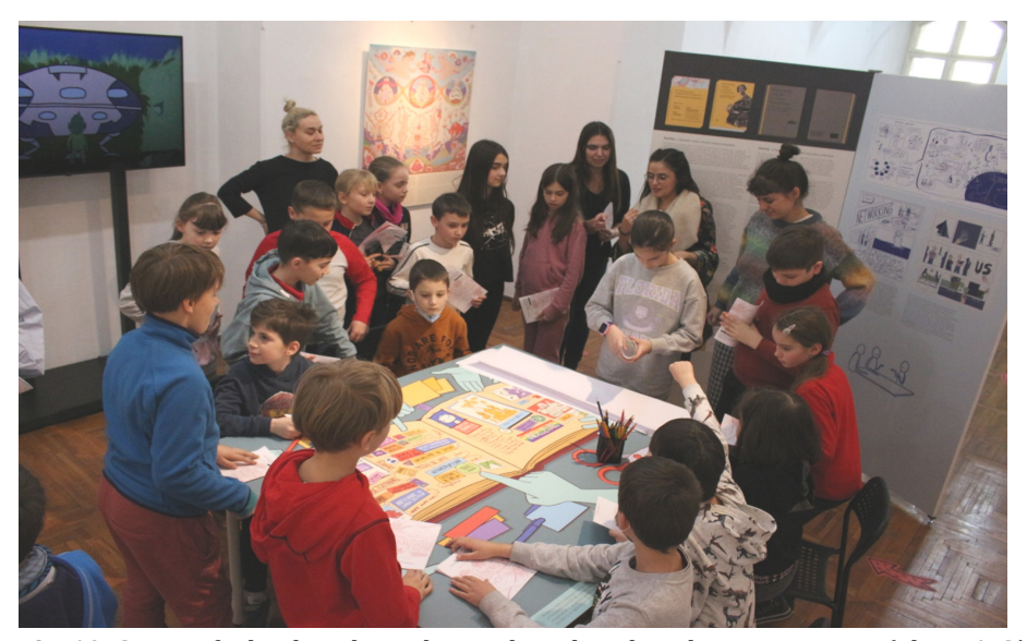
Fig. 10. Group of school students during the cultural mediation program.