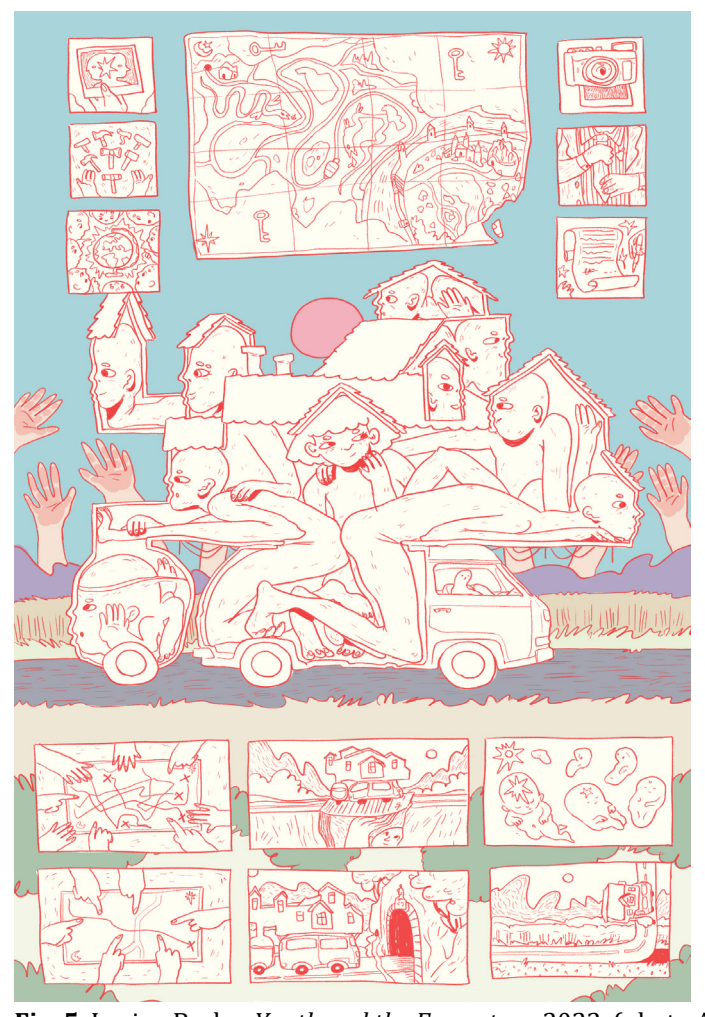
Fig. 5. Lucian Barbu, Youth and the Ecosystem, 2022.