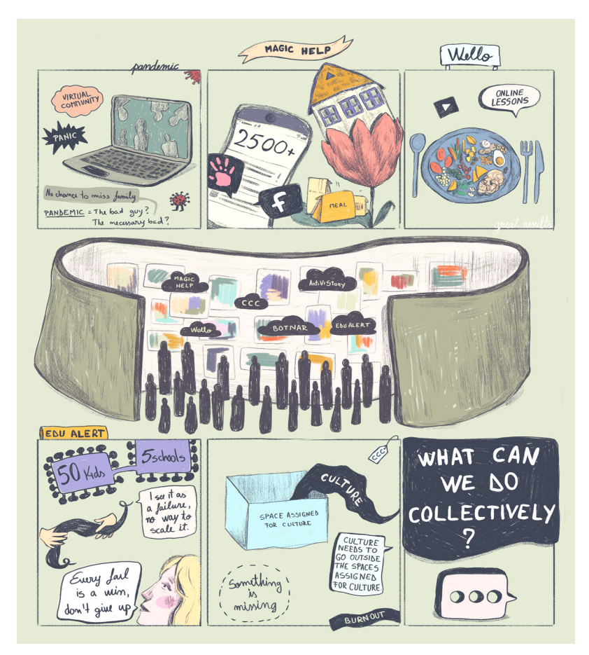
Fig. 2. Evelina Grigorean, Conceptual and Artistic Process, 2022.