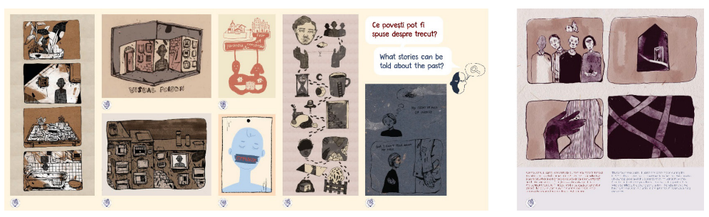
Fig. 4. Ureczki-Lázăr Melinda, Remembering the Past, 2022.