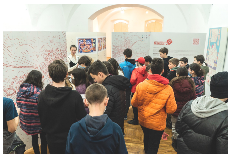
Fig. 9. Group of school students at the beginning of the cultural mediation program.