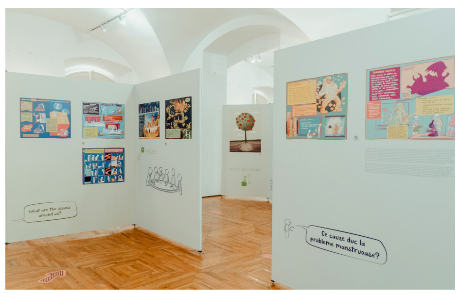
Fig. 8. Image from inside the exhibition space.