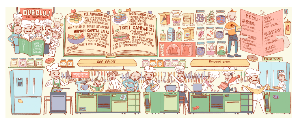
Fig. 3. Horațiu Coman, Ecosystem Mapping, 2022.