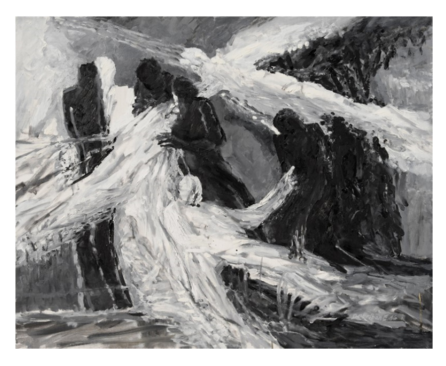
Emil Dobribán: A bölcs [The Wise]

Paintings entitled The Wise and The Removal from the Cross compels us to make multiple associations, whether visiting the exhibition, or looking them in a reproduction album.