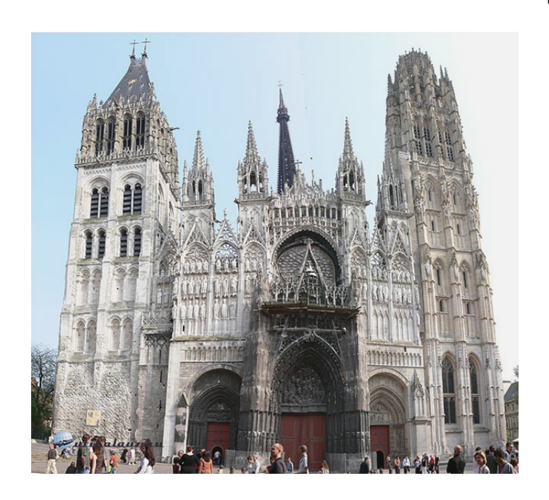
The Cathedral of Rouen (Photo)

We see the strong, clear outlines, corners and shapes. The realist painter would paint the cathedral as realistic as possible, with lights and shapes, exactly like the photo. But not the impressionist Monet, who wants to present not so much the cathedral itself, but the lights and colours reflected from the building. It's almost as if the cathedral would be a dream, a suggestion or impression, as it would be seen at a certain hour of the day, in a certain light. Monet made around thirty different paintings from the same cathedral, in different lighting conditions – on a sunny morning, on cloudy afternoon, and so on. The painting presented here shows the cathedral at sunset, when sun washes the stones in the dazzling dance of blue, orange and mauve colours. This is a certain impression of the Cathedral of Rouen."<sup>13</sup>