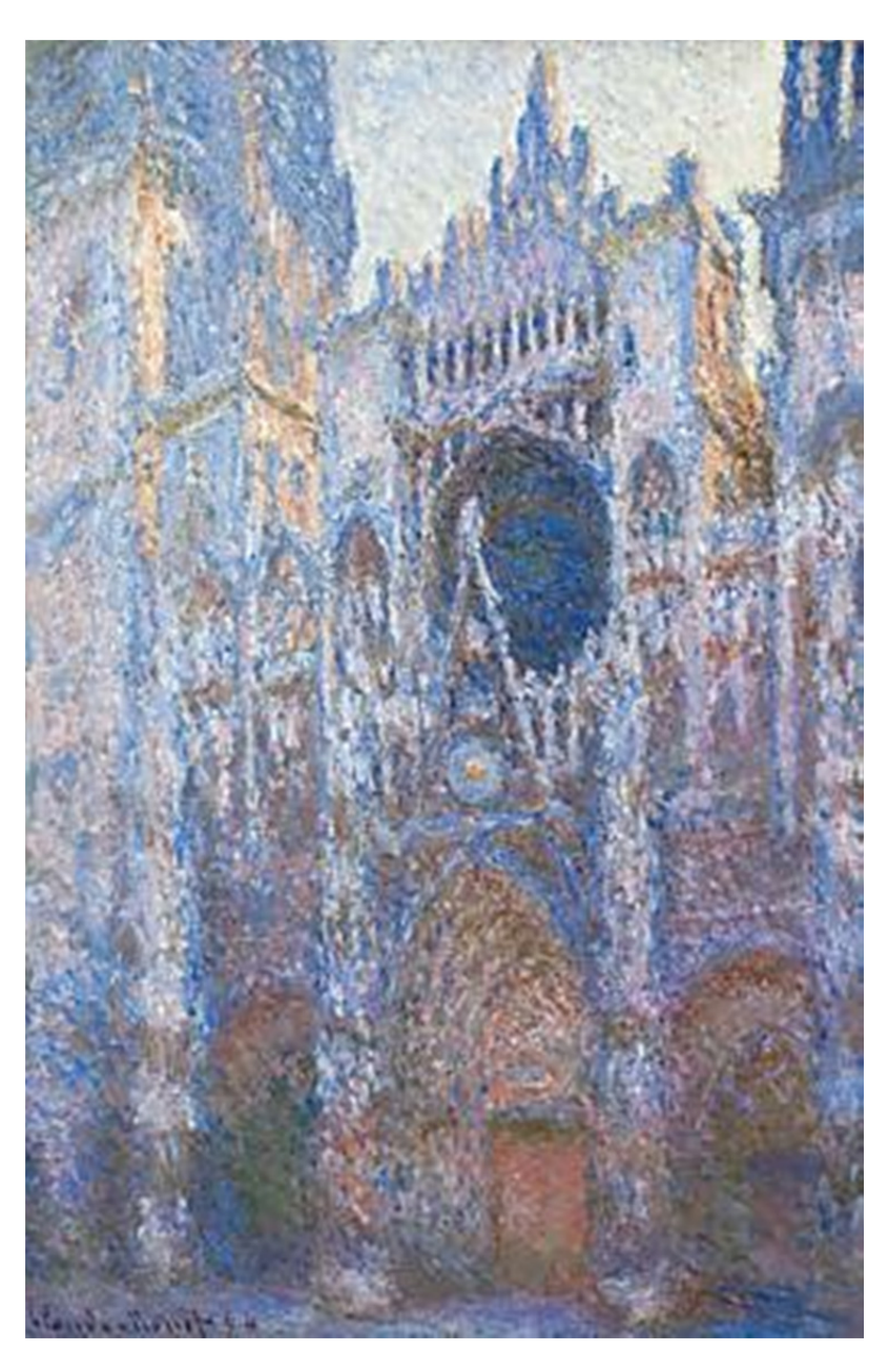
Monet: The Cathedral of Rouen