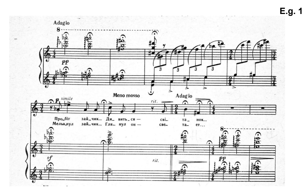
The miniature Morning (1-9 bars)

The boundary between the episodes is observed in the accompanying party. A deep caesura is created by many factors: a change in the thematic material, texture, tempo, fermata on a double bar line, and the like. The main building material of the first episode is the alternation of two themes: one of them is a homophonic-harmonic descending (by minor second) sequence of quarter-fifths (sometimes with attached seconds) chords; the second is arpeggio triplet ascending passages - also predominantly fourth jumps, which create a pulsating tense movement. Certain tonal foundations can be distinguished with a predominant tonal instability, when the arpeggio theme is performed for the first time, the initial accented notes create a movement along the dominant seventh chord D major; the second – the initial sounds form six-four chord (G major). The middle structure: "A bunny has come running, looks - dawn ..." - the vocal part and the accompaniment end in B major. So, the general foundations of each phrase line up in a major triad with a downward movement: D-B-G. The intense pulsation of the second episode is achieved by polymodes and polymetric by comparing two ostinato variant harmonic sequences: the initial balance in E major (13-16 bars) changes the fret instability with the supports on C / F, D sharp / -G sharp, E flat / A flat - a quick change of tonal colors in the middle of each episode, and also between them, metro-rhythmic pulsation reproduce the