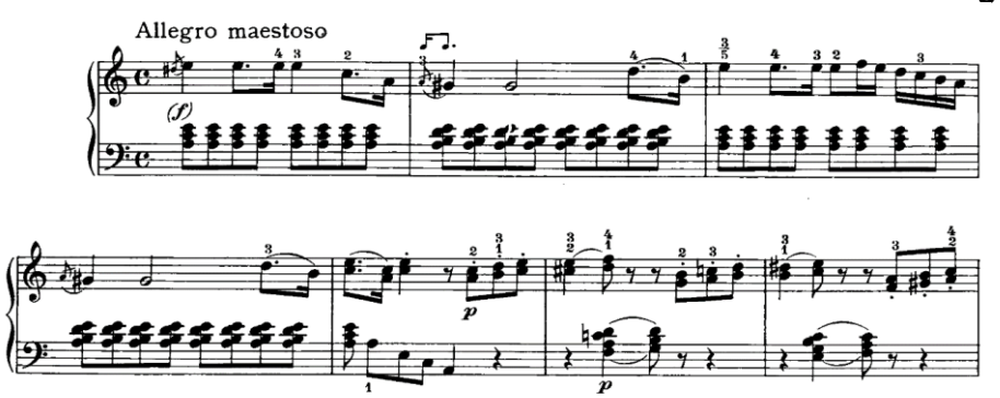
W. A. Mozart, Sonata A minor KV 310, I movement, m. 1-7.

And only in the last part, the musical-rhetorical figure of the catabasis is filled with the image of repentance, redemptive suffering, and the downward turns obey the psalmodic intonation. The catabasis figure expresses the "affect of submission".<sup>13</sup>