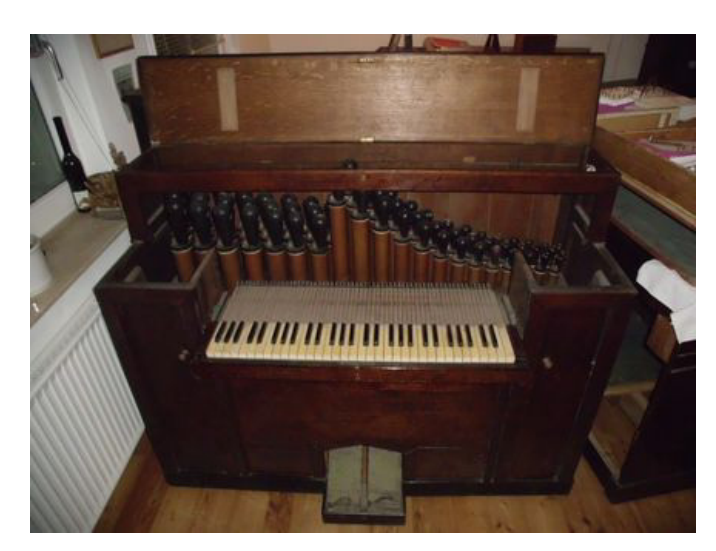
Grenié-Muller, Paris ca. 1820 Orgue expressif Système Grenié<sup>10</sup>

This instrument resembled an organ, but its pipes had reeds, and the air was produced by the performer's feet, making the sound much more dynamic and flexible compared to the rigid sound of the organ. According to Grenié, the sound of the Orgue expressif could vary from soft tones to the intensity of a military orchestra.