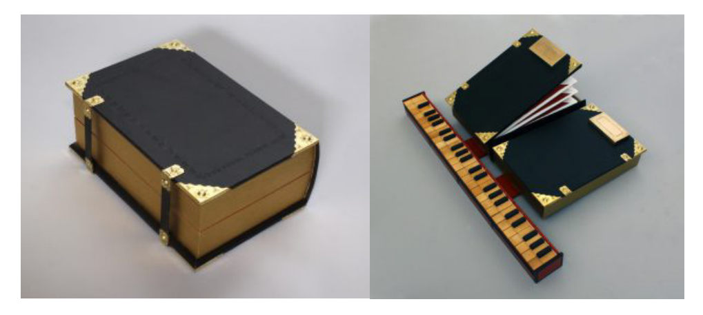
Bible regal in closed and in open states<sup>4</sup>

In 1700, the Italian Filipo Testa built a version of the regal that worked with free reeds, called the "organino." This could be considered the first organ with free reeds.<sup>5</sup>