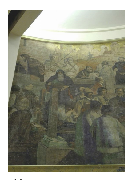
Details form the upper part of the composition "Cultural History of Transylvania", by Costin Petrescu, 1939, Great Hall, Universitarilor Palace, Cluj-Napoca.

The stylistic approach of the painting, with wide strokes and a sober colour palette in the upper part, is in contrast with the lower part where all the personalities' portraits are rendered by a schematic drawing with a cobalt blue simple line, on an ochre background with golden geometrical shapes and approximately in the same position as in the upper part. On this film of colour, under each portrait, the name of the depicted person appears and this enables the understanding of the upper composition, which comprises the portraits of the most representative scholars in Transylvania in the period 16th century – 19th century, as follows: Metropolitan Bishop Simion Ştefan, Archpriest Radu Tempea, Paul Iorgovici, Cantor Dimitrie Eustatievici, Bishop Ioan Inocențiu Micu, Gheorghe Şincai, Petru Maior, C. Diaconovici Loga, Ion Molnar Piuariu, I. Budai Deleanu, Priest Samuil Micu, Bishop Vasile Moga, Andrei Mureșanu, Ștefan Octavian Iosif, George Coşbuc, Metropolitan Bishop Andrei Şaguna, Octavian Goga, Gheorghe Barițiu, Gheorghe Pop de Băsești, Vasile Goldiș, Simion Bărnuțiu and Timotei Cipariu.