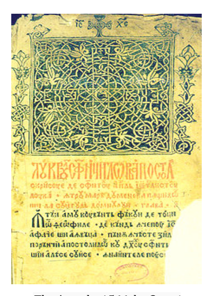
The Apostle, 1566, by Coresi

This remarkable and valuable person whose statute has been captured in written documents or fine arts portrayals, opened the way for writing in Romanian , and the Coresian image has been known and appreciated, especially starting from the 18th century until now, due to researches in the field of history, theology and fine arts. 2016 has been declared by the Saint Synod of the Romanian Orthodox Church also the commemorative year of religious typographers, one of whom is Coresi, depicted in this article aiming to highlight the Coresian image.