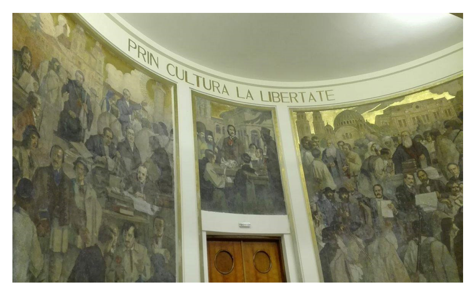
Detail – upper parts of the monumental painting by Costin Petrescu, Great Hall, Universitarilor Palace, Cluj-Napoca

The records of those times and also the restoration results reveal that one year later, in 1940, the entire painting was covered with a layer of paint so as to conceal the role of the Transylvanian scholars; over the years, other layers were added until in 1999, after restoration, they were scraped off the painting and the work of art was given back to the public in its original form. Thus, the painting in the Great Hall of the Universitarilor Palace was severely degraded by this covering method and we now consider that it would have been more proper to choose the same approach used for the Romanian Athenaeum, where the fresco created by the same artist was covered with red velvet during communism (from 1948 to 1966) so as to hide the monarchy's role in Romania's history.