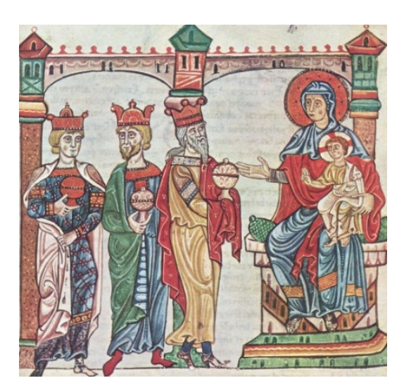
Adoration of the Magi, water colors on paper, XIII-th century, The Vatican Apostolic Library, Vatican.

Something special, the fresco from Cappadocia presents a greater number of worshipers bringing gifts to Jesus. The Magi have around their heads, devoted positioned, white halos, while Mother of God, Jesus and Joseph have yellow halos. Another distinctive element is the appearance of the herald angel in the left side of the image, above all.