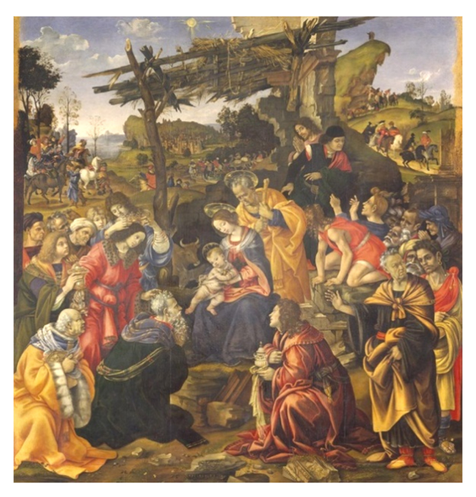
Filipinno Lippi, Adoration of the Magi , oil on wood, 1496, Galleria degli Uffizi, Florence.