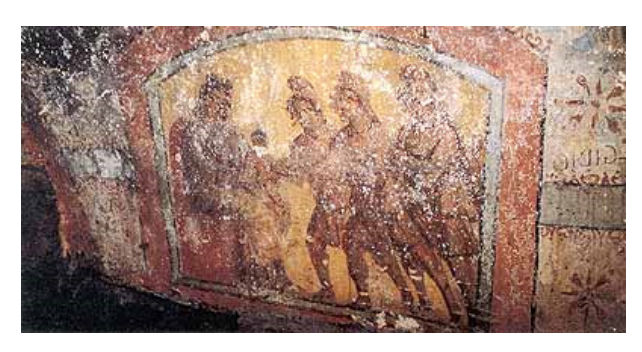
Adoration of the Magi, fresco, IV-th century, Catacomb of San Callisto, Rome.

The relief with the theme The Adoration of the Magi, resumes the conceptional scheme from the Catacombs of San Callisto<sup>7</sup>, in this case being more highlighted the entire ensemble. The Magi are presented as three young men with large movements, carrying offerings; the origin of the vestment is Phrygian. The three camels mark the origin and the place of the event. The first Magus shows with his right hand the guiding star, which is above Mary and the Holy Child sitting on throne. Also represented in profile, the couple Maria-Jesus expresses the inner peace, an intimate plastic aspect. The author does not invest the two figures with the sacred insignia, the halos.