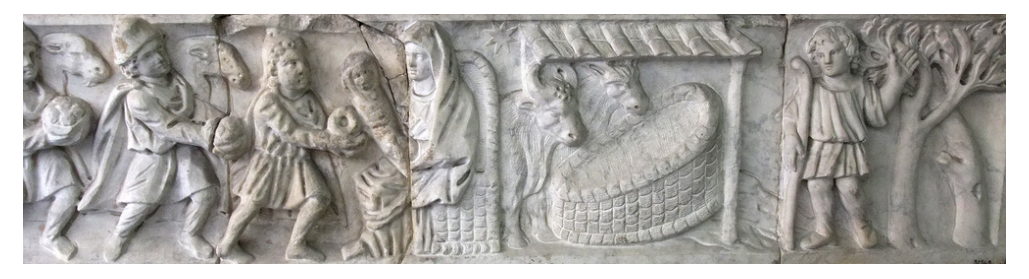
Adoration of the Magi, bas-relief, IV-th century, Vatican Museum, Rome.

In both examples, we can observe the representation of Mary and Jesus, usually in profile, and in front of them are the three Magi; with a bigger liveliness in movement, rhythm and the details stated above is the mural/fresco from the fourth century from the Catacombs of San Callisto. Among the remarkable presentations of this theme, we can remind the mosaics of the Basilica of San Vitale<sup>6</sup> from Ravenna, or the ones from Santa Maria Maggiore from Rome.