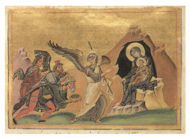
Adoration of the Magi, miniature, X-th century, The Menology of Vasile the Second, The Vatican Library, Rome.

There are also the Magi of San Vitale, they wear mantles, red fezzes and they have gifts in hands. The procession is moving to the Virgin sitting on the throne, holding Jesus, together with Archangels.