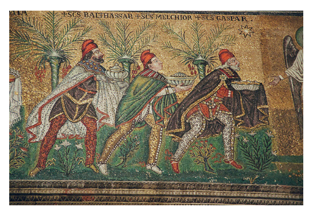
Adoration of the Magi, mosaic, VI-th century, Basilica San Vitale, Ravenna.

The complex composition from the Papal Basilica of Santa Maria Maggiore, reveals us a scene in which Jesus, on the throne, blesses the Magi, His Mother is near Him, as well as the Angels, a shepherd and a queen; the whole scene stands under the guiding star. The Magi are presented as being young, with colored clothing, wearing the Phrygian cap. There are some buildings with slender roofs that shape in the distance, Jerusalem.