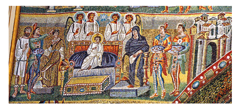
Adoration of the magi, mosaic, V-th century, Santa Maria Maggiore Basilica, Rome.

The scene from the Catacomb of San Callisto resumes, in a reduced form, The Adoration of the Magi. The clothing is important (the Phrygian caps), which are like a leit motif in all these anonymous compositions. The yellow background definitely makes us think at the future gold fund, which will be naturalized in the Byzantine canon.