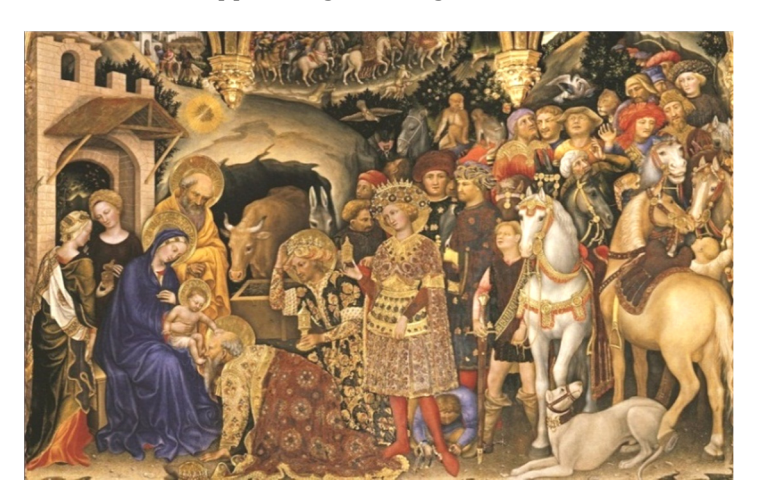
Gentile da Fabriano, Adoration of the Magi , tempera on wood, 1423, Galleria degli Uffizi, Florence.

The broad perspective of Gentile da Fabriano proposes a magnificent scene that illustrates the spectacular art of picture. The author exceeds the restricted frame of byzantine patterns, turning it into a large one, grandiose due to the impressive number of figures, animals and architectural elements.