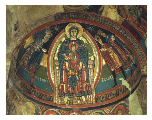
Adoration of the Magi, fresco, XII-th century, Taull Churh.

The artist chose to illustrate this theme, not together with other scenes from the church iconography, but in the Holy Altar Apse. If in almost every example, The Virgin with The Child are on one side or the other, in this case, they dominate the central semi-calotte. What is more, they are framed by a large mandorla. On the background of a colored strip and willing asymmetric, are the Magi, one on the left side and the other two on the right side. In terms of composition, the artist assumes the traditional structure of the Madonna and Child on a Curved Throne, met in Byzantine and Post-Byzantine iconography.