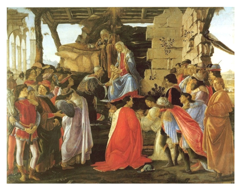
Sandro Botticelli, Adoration of the Magi , tempera on wood, 1475, Galleria degli Uffizi, Florența.

The beauty of this painting followed by a large variety of preparatory studies consists in the strict and balanced organization of the whole picture dominated by multiple characters. It was unfinished. The Virgin with the Holy Child can be seen at the bottom of the picture, surrounded by many people full of devotion and adoration. Between Her and the two old men symmetrically placed on both sides of the scene, forming a triangle. It is taken over by the semicircular shape of the grouped figures. Behind them are ruined buildings, horses, riders, a magnificent scale, trees and other figures captured in various movements. We can distinguish a fight between two stallions on the right side. The theme is conceived in light and shade contrast and defines the art of Leonard. It was considered a novelty in that period, a period that marked the end of his collaboration with Verrocchio.