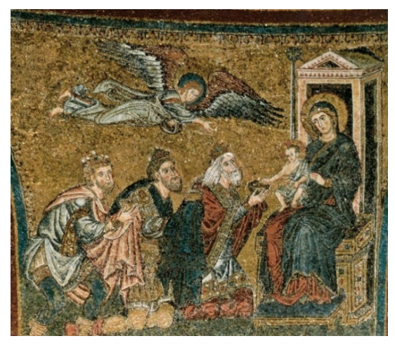
Jacopo Torriti, Adoration of the Magi , mosaic, XIII-th century, Santa Maria Magiore Basilica, Rome.

The artist chose to illustrate this theme, not together with other scenes from the church iconography, but in the Holy Altar Apse. If in almost every example, The Virgin with The Child are on one side or the other, in this case, they dominate the central semi-calotte. What is more, they are framed by a large mandorla. On the background of a colored strip and willing asymmetric, are the Magi, one on the left side and the other two on the right side. In terms of composition, the artist assumes the traditional structure of the Madonna and Child on a Curved Throne, met in Byzantine and Post-Byzantine iconography.