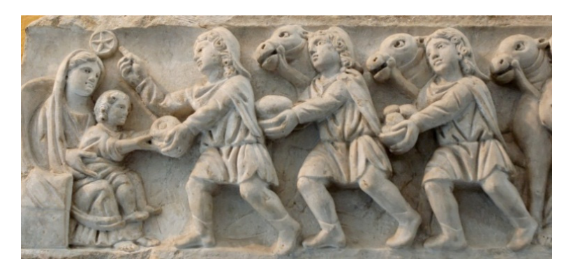
Adoration of the Magi, bas-relief, IV-th century, Pio Cristiano Museum, Rome.

The composition plastically narrates the gifts presentation of the Magi to the Son of God and to His Mother. The Child is in swaddling-clothes, held by Mary. Magi are accompanied by the busts in relief of some camels. In the back of the throne, we can distinguish the empty manger, according to Saint Luke the Evangelist (2, 12), followed by the two symbolic animals: the ox and the ass. Flanking the right side of the bas-relief, Saint Joseph has a high staff, being emphasized having raised the left hand.