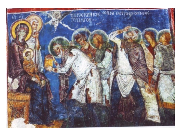
Adoration of the Magi, fresco, XII-th century, Cappadocia.

Something special, the fresco from Cappadocia presents a greater number of worshipers bringing gifts to Jesus. The Magi have around their heads, devoted positioned, white halos, while Mother of God, Jesus and Joseph have yellow halos. Another distinctive element is the appearance of the herald angel in the left side of the image, above all.